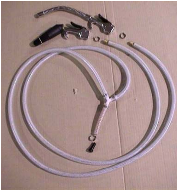
500-A100 Tool Hose Assembly