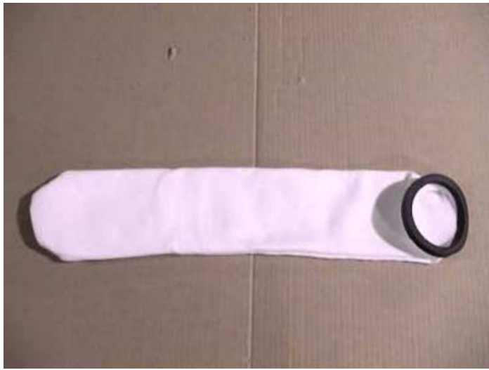
← 300-003 Primary Microfilter (Pack of 6)