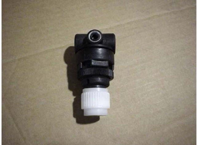
300-009B Air Regulator