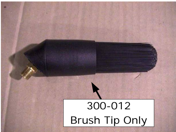
300-012 Brush Tip Only