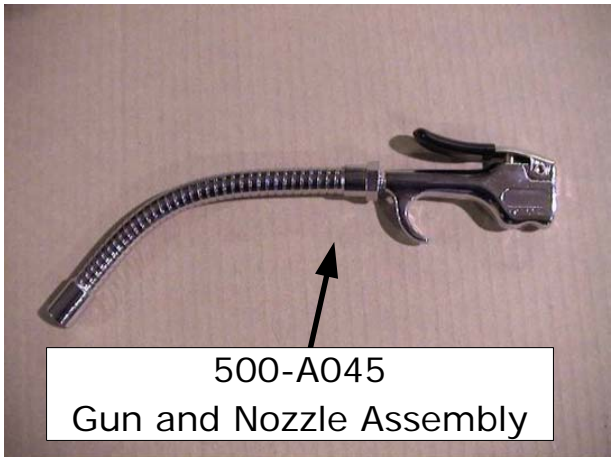
500-A045 Gun and Nozzle Assembly