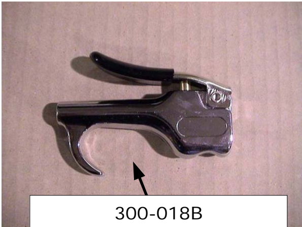
300-018B Gun Only