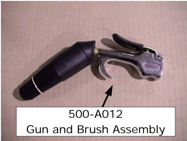
500-A012 Gun and Brush Assembly