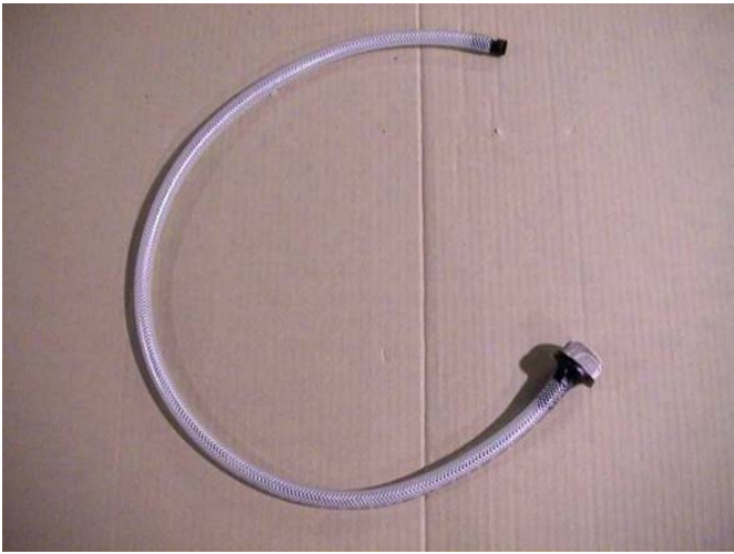
300-A078B Fluid Pickup Tube (hangs inside of basin)