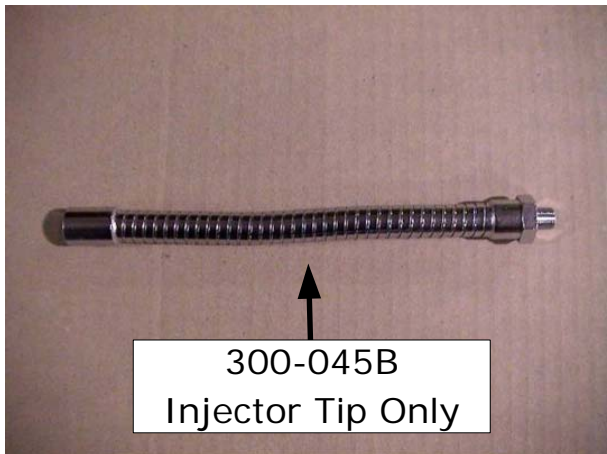
300-045B Injector Tip Only